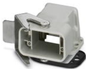
Panel mounting base with single locking engagement nose, angled design

Please be informed that the data shown in this PDF Document is generated from our Online Catalog. Please find the complete data in the user's documentation. Our General Terms of Use for Downloads are valid ( http://download.phoenixcontact.com )