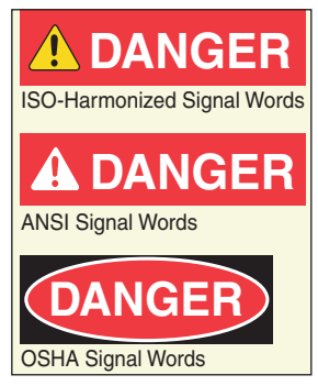
ANSI, OSHA, and ISO Signal Words